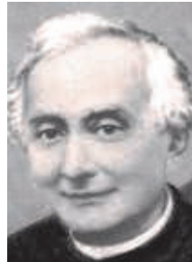
Francesco Spinelli Diocesan Priest, Founder of the Institute of the Sisters Adorers of the Blessed Sacrament 1853-1913