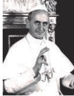
Pope Paul VI Pope from 1963-1978 1897-1978

On October 14th, Pope Francis will be canonizing 7 new saints! EWTN will be providing television coverage of the Holy Mass and Canonizations at: 2:30 am (live coverage) and 11:00 am (rebroadcast)