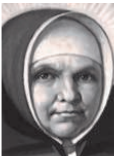
Maria Katharina Kasper Virgin, Foundress of the Institute of the Poor Handmaids of Jesus Christ 1820-1898