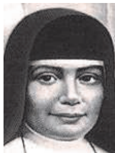
Nazaria Ignacia of Saint Teresa of Jesus Virgin, Foundress of the Congregation of the Missionary Crusaders of the Church 1889-1943