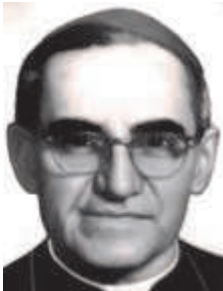
Óscar Arnulfo Romero Galdámez Archbishop San Salvador, martyred while saying Mass 1917-1980