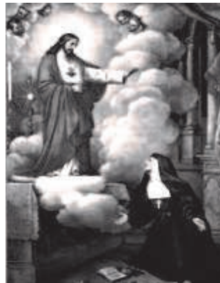
October 16th Feast Day Saint Margaret Mary Alacoque 1647 - 1690

“Unite yourself with Him (Jesus)... in all that you do. Refer everything to His glory. Set up your abode in this loving Heart of Jesus and you will there find lasting peace and strength both to bring to fruition all the good desires He inspires in you, and to avoid every deliberate fault.”